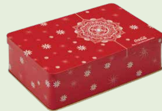
CONFECTION BOX PACK SIZE: 226MM X 141MM