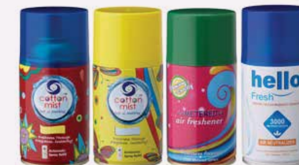
AIR FRESHENER CANS