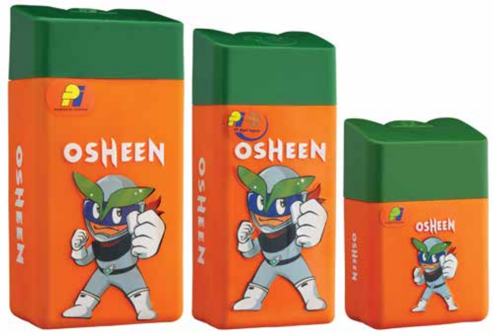
OSHN PACK SIZE: 250ML | 500ML | 1LTR