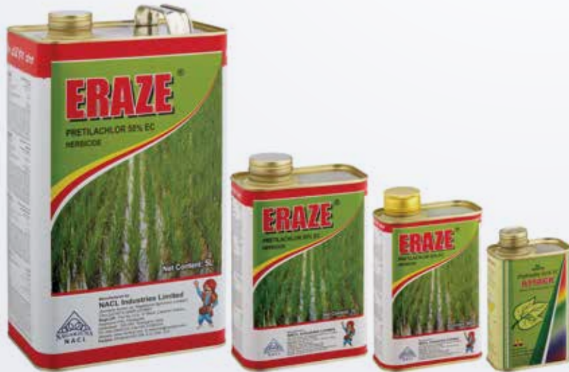
INSECTICIDE & CHEMICALS - RECT

PACK SIZE: 150ML | 250ML | 500ML | 1LTR | 3LTR | 5LTR