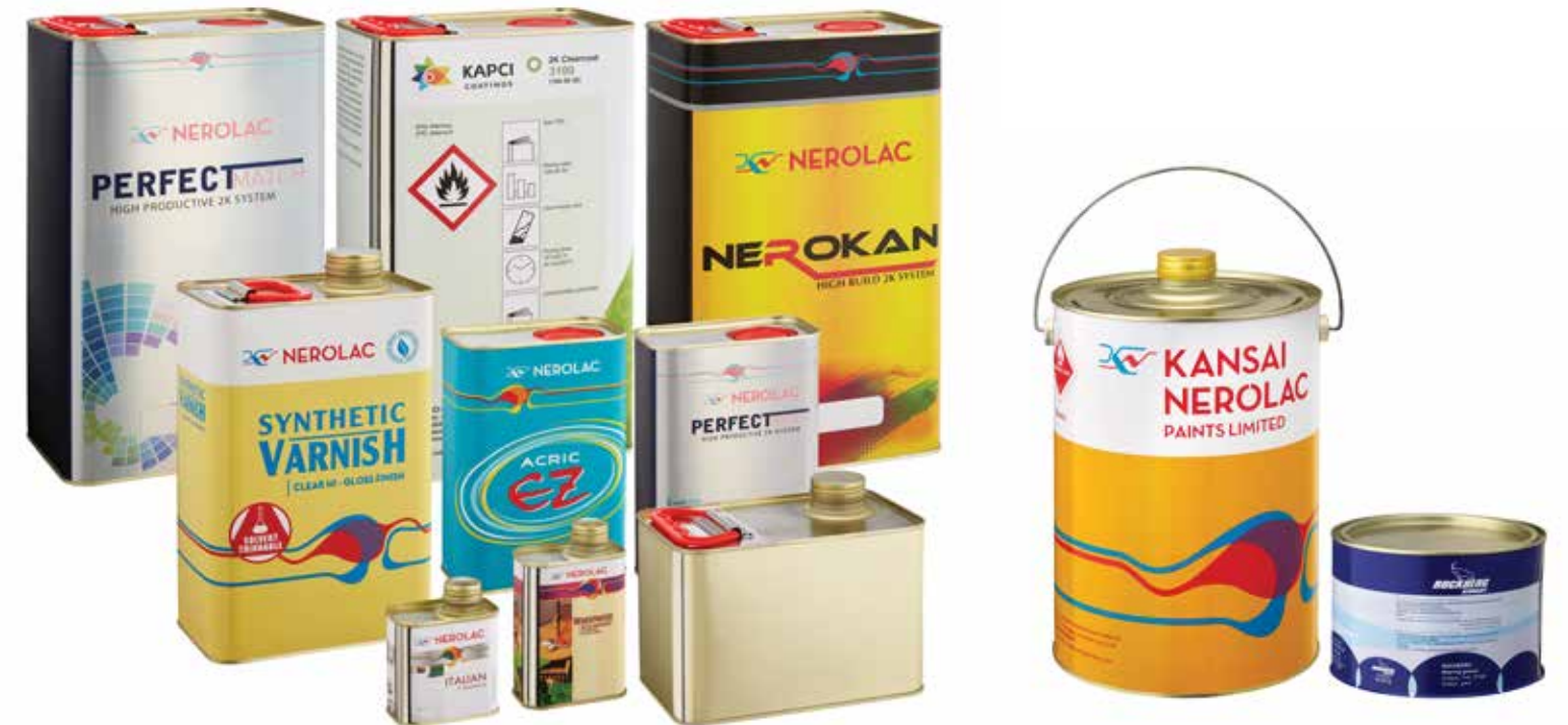
PAINTS & COATING