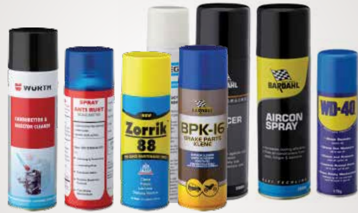
INDUSTRIAL SPRAY CANS