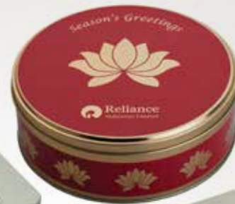
RIL-175 / 190