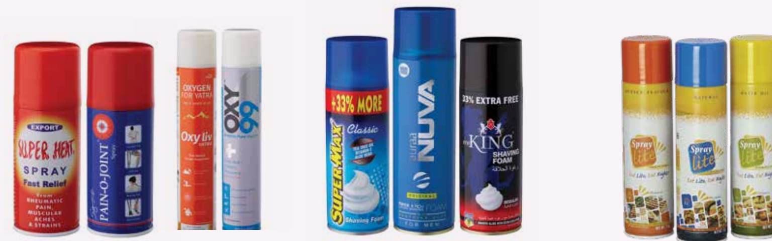
MEDICAL CARE CANS