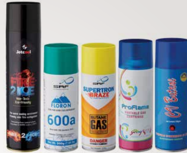
GAS / CHEMICAL AEROSOL CANS