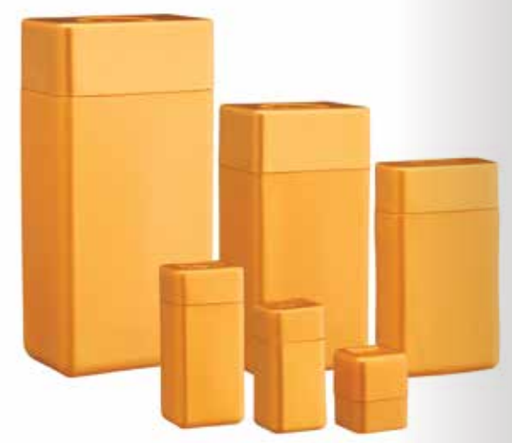
NOMINEE PACK SIZE: 10ML | 40ML | 80ML 200ML | 500ML | 1LTR