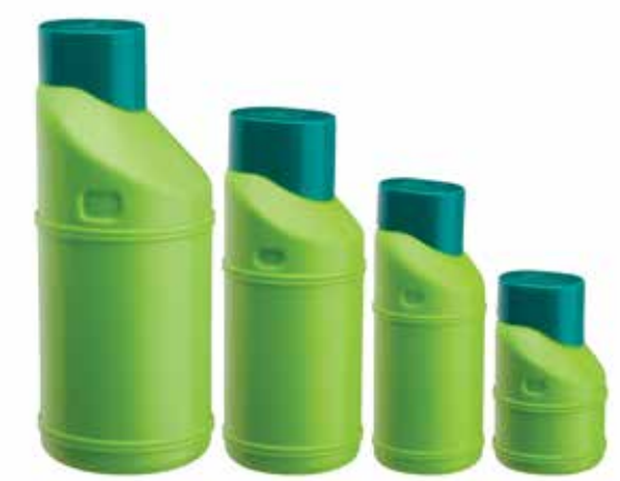
PI-BIO VITA PACK SIZE: 100ML | 250ML 500ML | 1LTR