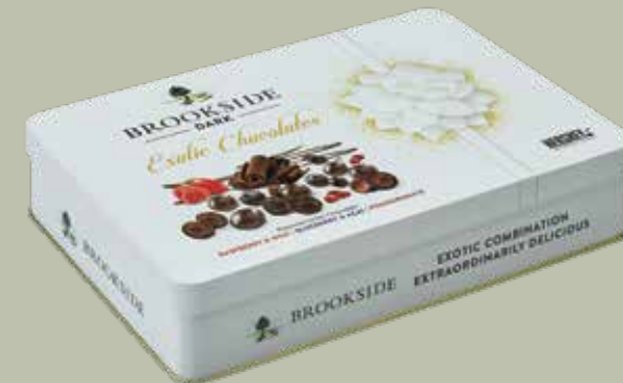
CONFECTION BOX PACK SIZE: 226MM X 141MM