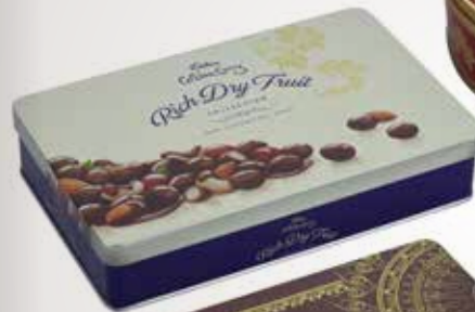
CAD-350 PACK SIZE: 226MM X 141MM