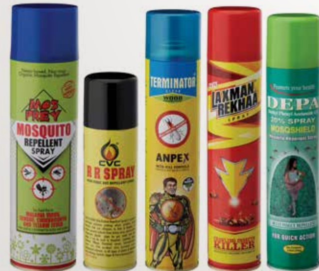
INSECTICIDES SPRAY CANS