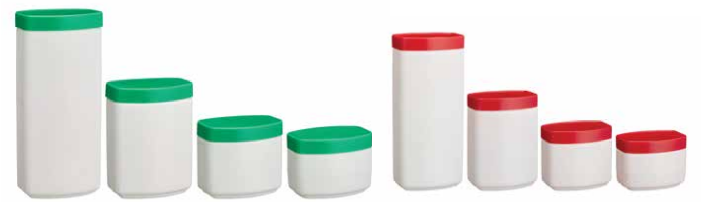
MAXIMA PACK SIZE: 100ML | 250ML | 500ML | 1LTR