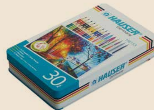
CONFECTION BOX PACK SIZE: 226MM X 141MM