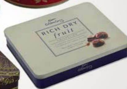
CAD-250 PACK SIZE: 202MM X 162MM