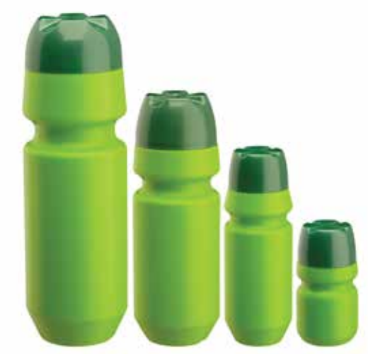
SQUEEZE BOTTLE PACK SIZE: 100ML | 250ML 500ML | 1LTR