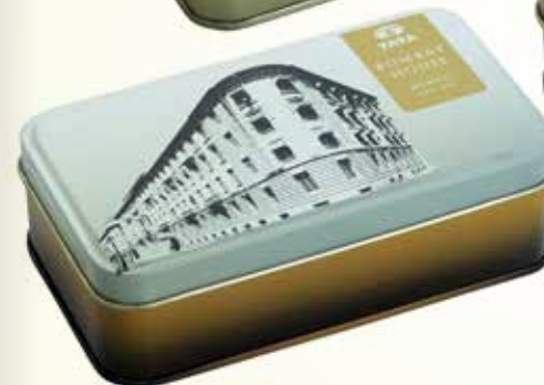
INSP PACK SIZE: 135MM X 75MM