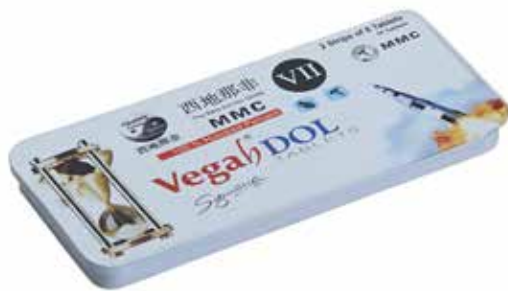
SLIDE TABLET BOX