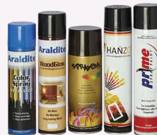
SPRAY PAINT CANS