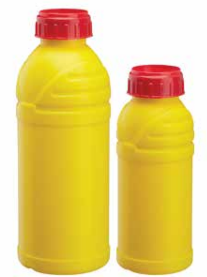
BUTTERFLY BOTTLE PACK SIZE: 250ML | 500ML