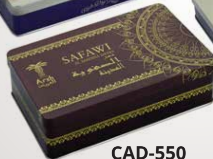
CAD-550 PACK SIZE: 226MM X 141MM