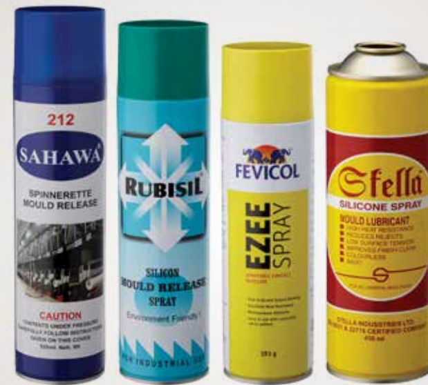
MOULD RELEASE CANS